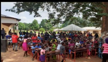
Left: A local school we built to try and improve the educational standards for the poor community. It was a success because it brought a huge impact also by creating employment to the unemployed but qualified villagers.