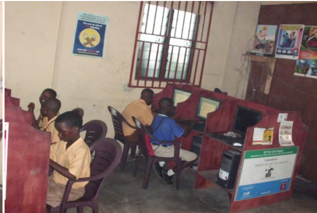
We provide free ICT education to school children after close from school, to prepare them for the future