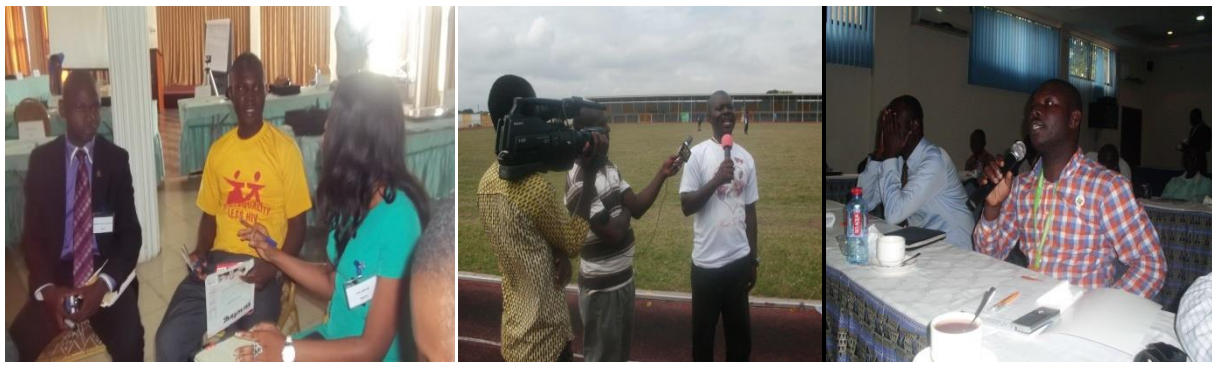
We utilize every platform to address the issues and ensure that positive response emerge out of it