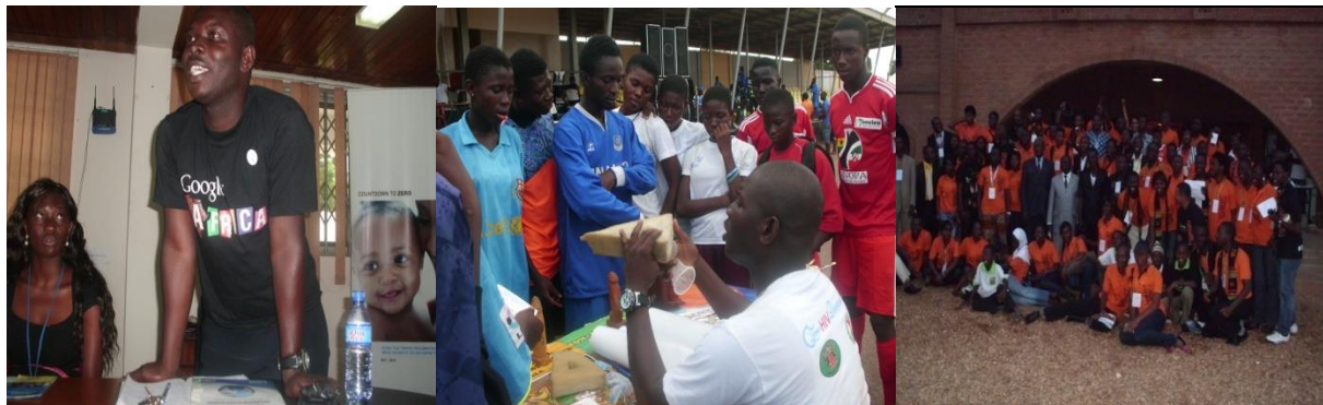
YES, we were part of the success stories of 2013 and are proud of it