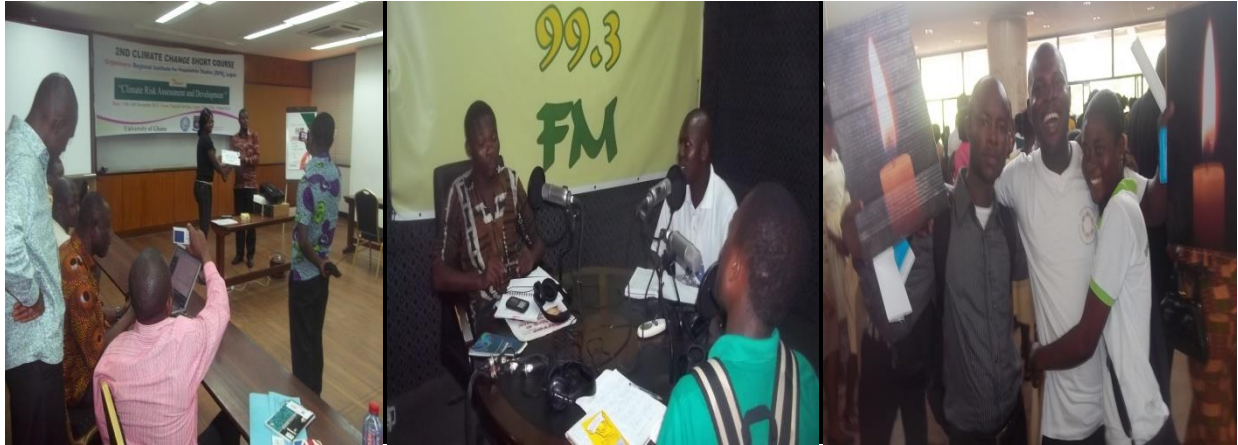
We inform the public to make informed fruitful choice