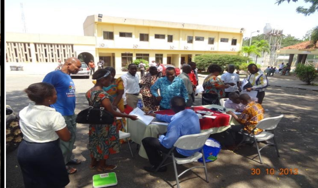
Scene of meetings, public health outreaches to mark the Africa Patient Solidarity Day, 30th October, 2013