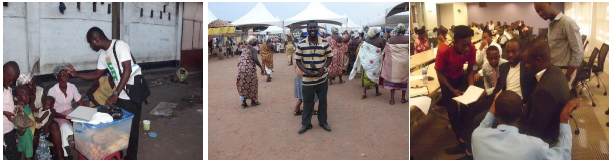
We go to the street to find out their concerns and plan well ahead of time to meet their needs