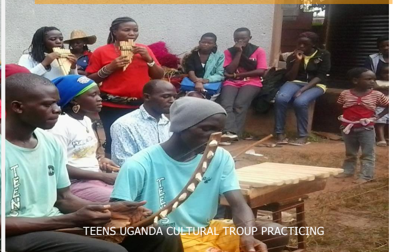
TEENS UGANDA CULTURAL TROUP PRACTICING

GREEN TRANSPORT: TEENS Uganda subscribes to the Uganda Sustainable Transport Network (UST-Network) that seek to promote green, safe, non congested transport that translates into health disciplines in prevention of respiratory diseases i.e. hypertension, diabetes, Obesity, etc