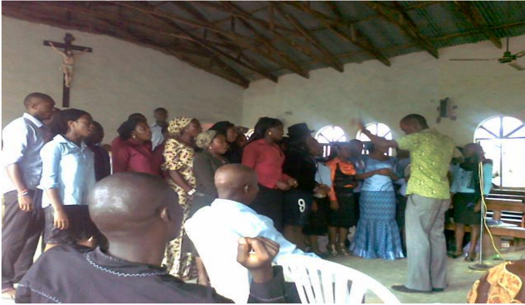
Singing songs of hope and better future ahead for the youths of Nigeria (Catholic Youth Organisation of Nigeria CYON)