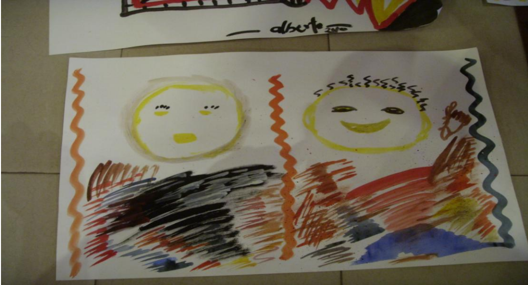
The ugly side of approach to governance and the renewed hope for good governance