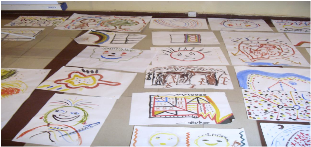
Different pictorial ideas of Good Governance drawn by the youth participant at the 2012 International Youth Day