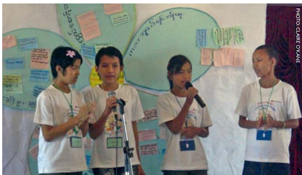
Children in Myanmar share their views of Save the Children programmes

In May 2011, 34 children's representatives from 17 townships where Save the Children was implementing programmes were brought together in a National Children's Forum, to share their feedback on all the sector programmes – child protection, education, child survival, hunger, and HIV and AIDS. The 17 girls and 17 boys aged 9 to 18 were from diverse backgrounds, including working children and children from poor families. Children and young people were able to share their experiences and views on the strengths and weaknesses of existing programmes. On the final day of the forum, the children and young people presented their key findings and views to senior managers and programme staff. Key findings were also documented and used to inform the 2012 annual planning process.