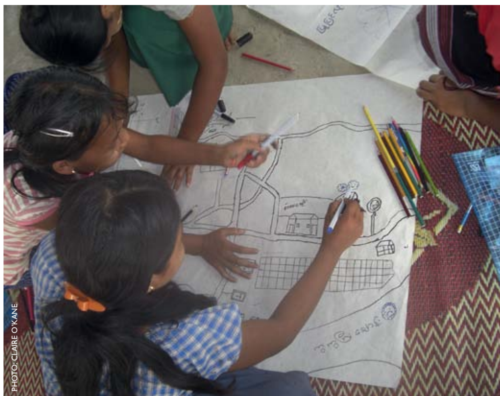
Children in Myanmar carrying out a risk-mapping of their community