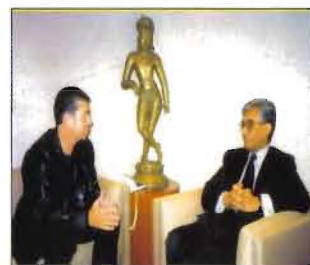
UN Representative of India