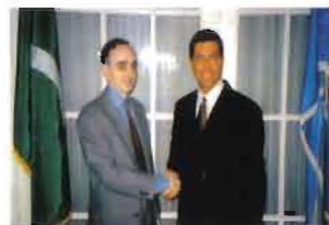
UN Representative of Pakistan