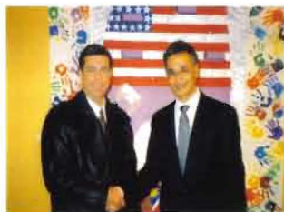
UN Representative of Israel