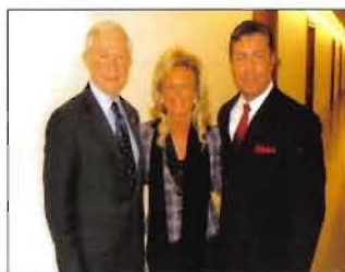
US Congressman Jeff Sessions