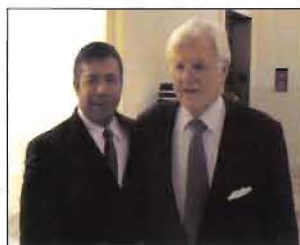
US Senator Ted Kennedy