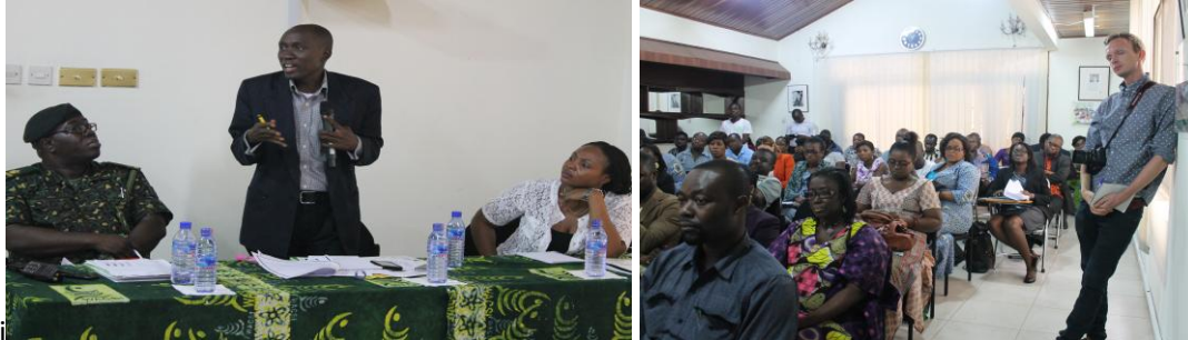
Scene of training

ng section organized by the WACSI here in Accra