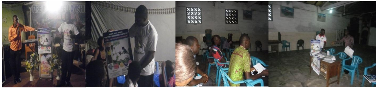
HELD IN THE MONTH OF AUGUST, 2014 IN THE ASHIEDU-KETETE DISTRICT