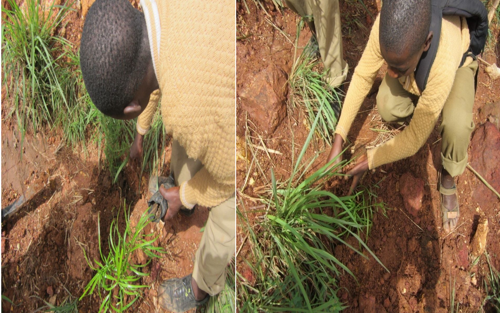
Student of GTC planting trees to sustain their campus