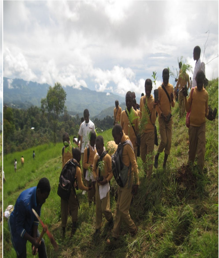
Trees planting Exercise in GTC campus