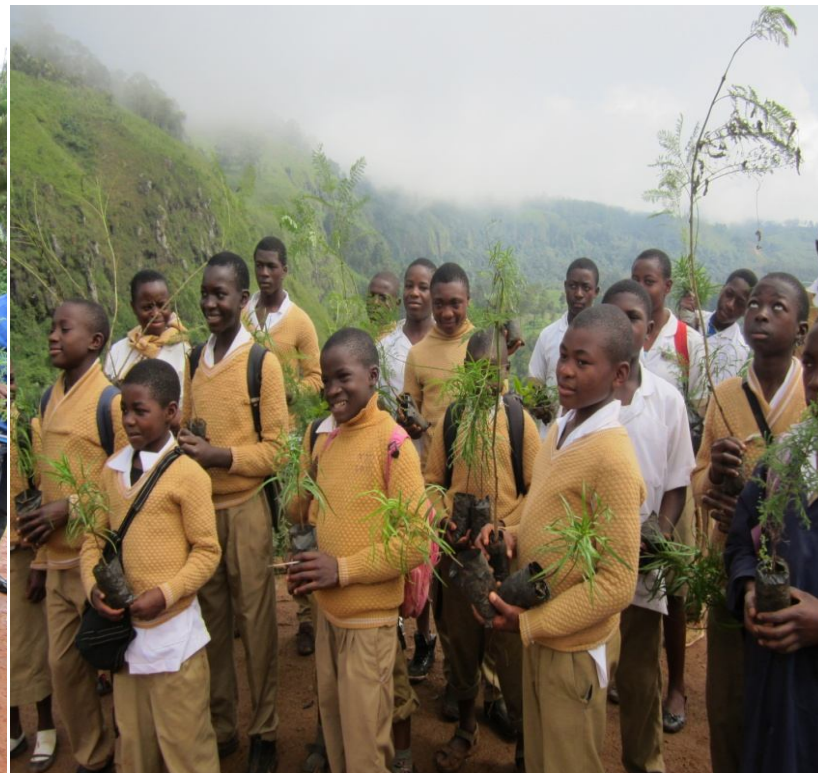
Students of GTC Bamendankwe