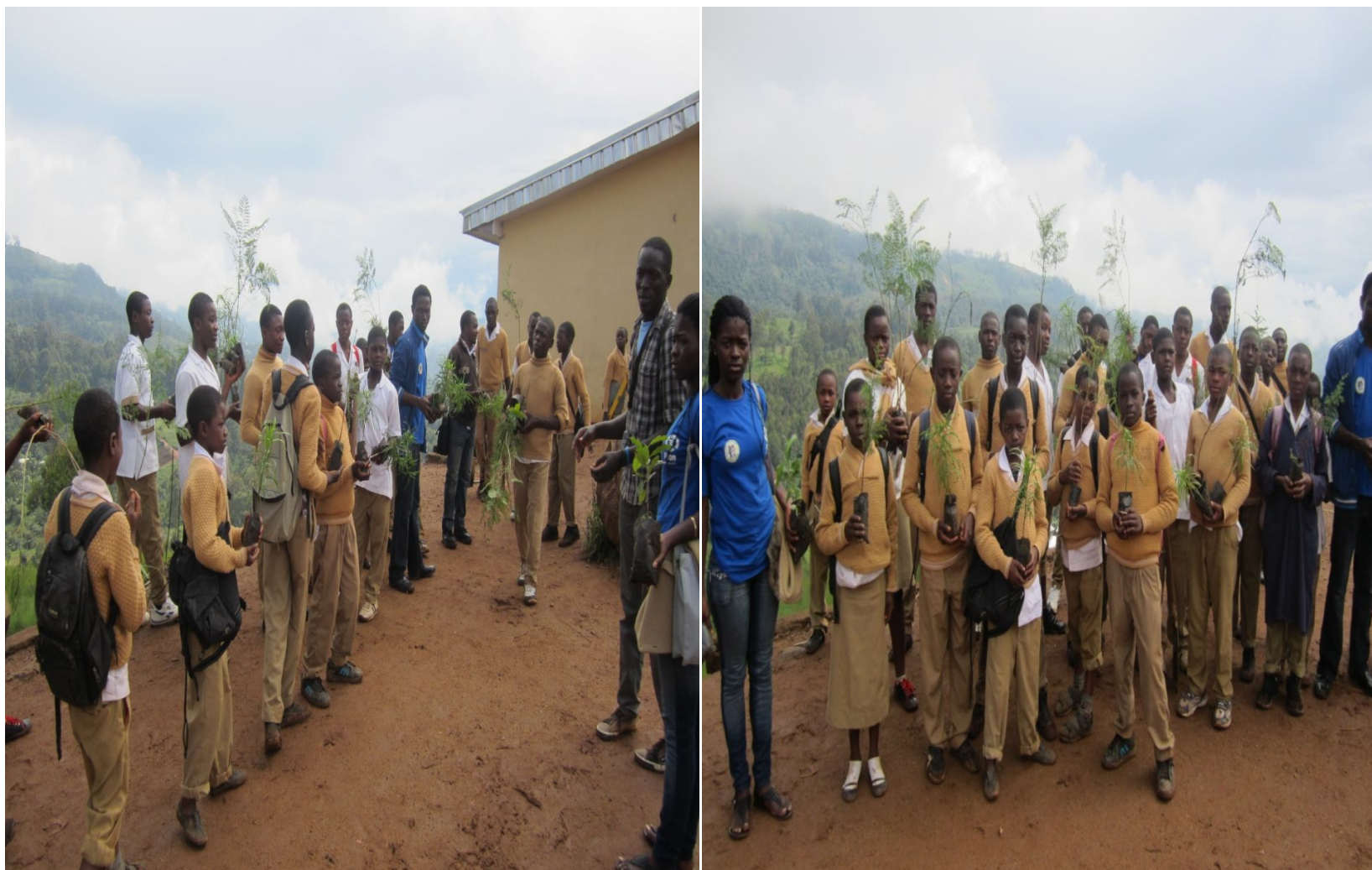
Students of GTC holding their tree and ready to take action