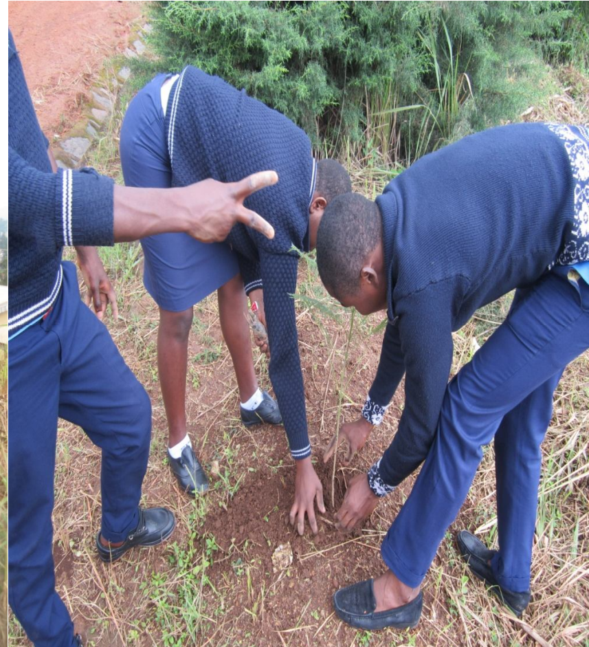
GBHS students planting trees in their school campus to mark the IDP