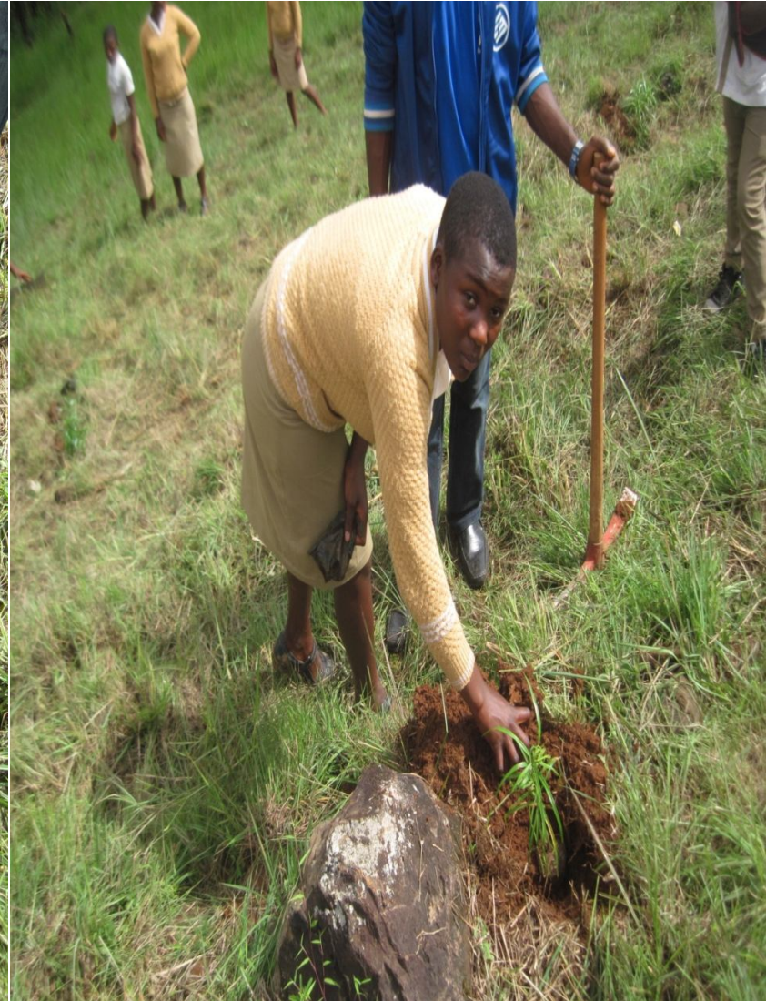
Student of GTC planting trees to sustain their campus