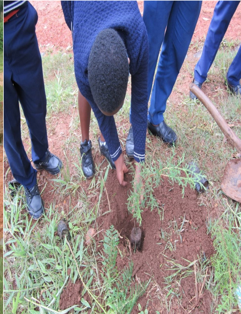
GBHS students planting trees in their school campus to mark the IDP