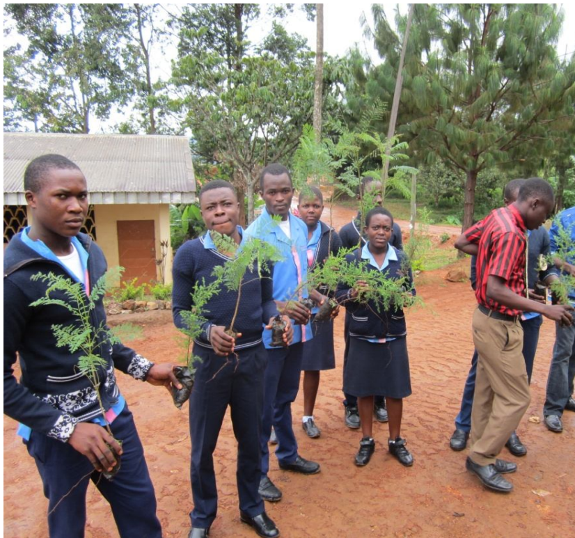
Students of GBHS Down-Town

The international Day of Peace in Bamenda, Cameroon was celebrated through a Tree Planting Party with students from two secondary schools respectively Government Bilingual High School (GBHS) Down-Town and Government Technical School (GTC) Bamendankwe. The trees were offered to us by the Regional Delegation of Forestry and Wildlife. The 100 trees were of three different categories which included Cyprus, Podocarpus and Jacaranda. We planted them in schools campus around strategic areas proposed by the schools administration. We took four hours to complete the tree planting exercise with full respect of the 1 minute of silent recommended by the UN Secretary General.