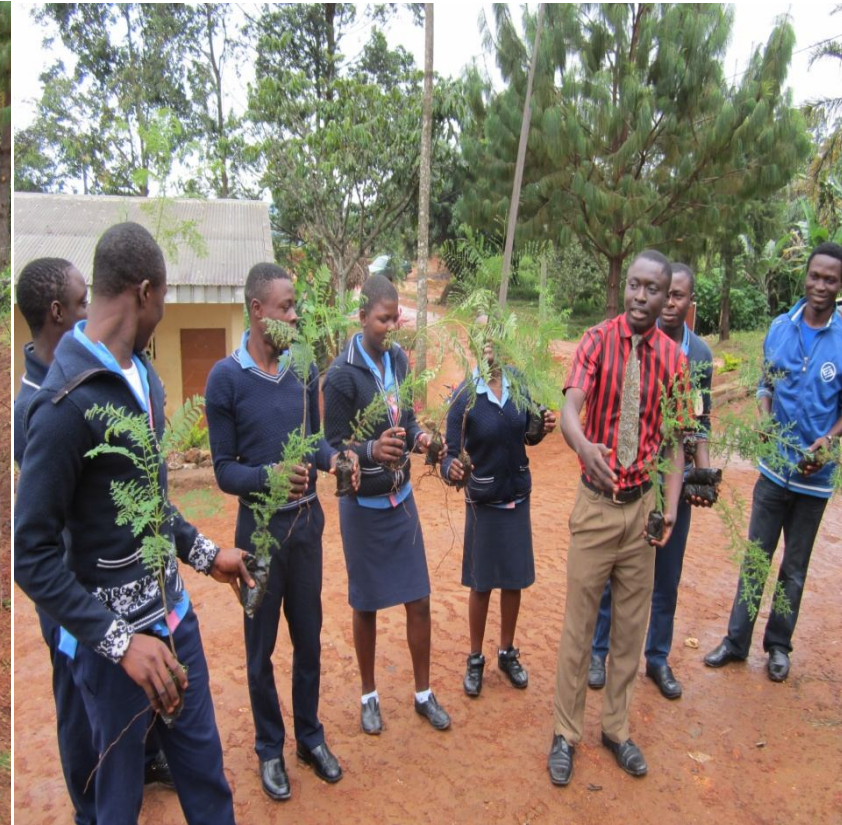
Students of GBHS Down-Town holding Jacaranda trees and Cyprus for planting around the school campus