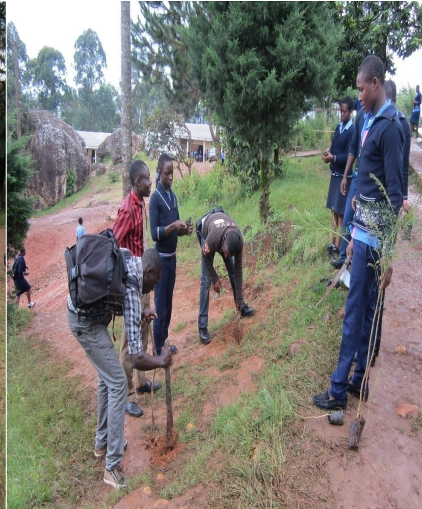
Tree planting exercise by BYCCC members and students