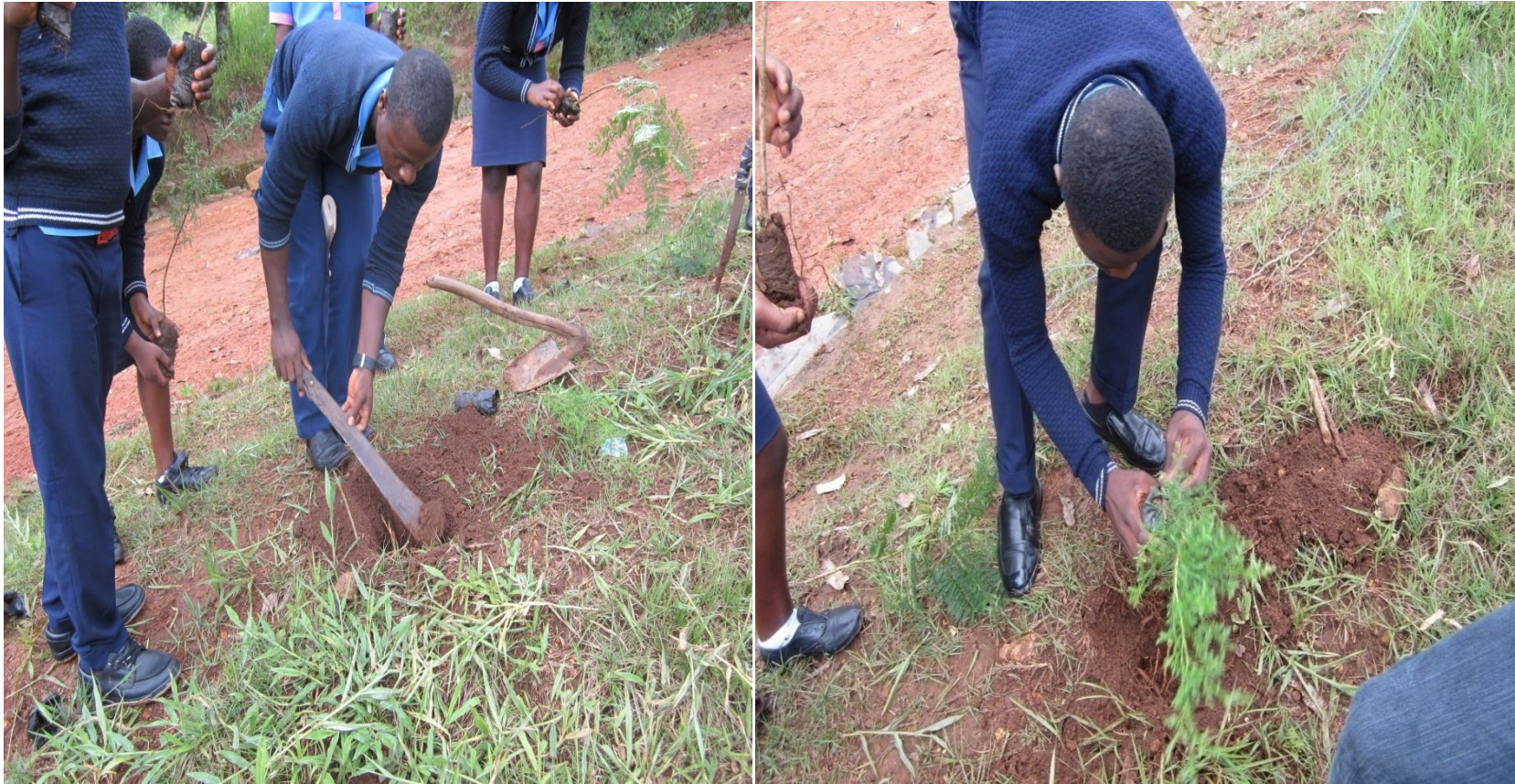
GBHS students planting trees in their school campus to mark the IDP