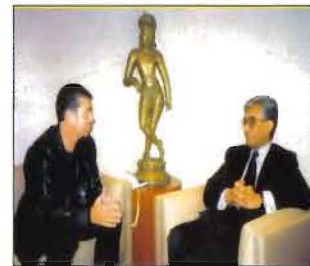
UN Representative of India