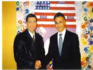
UN Representative of Israel