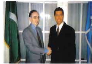
UN Representative of Pakistan