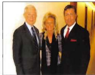
US Congressman Jeff Sessions