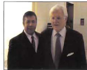
US Senator Ted Kennedy