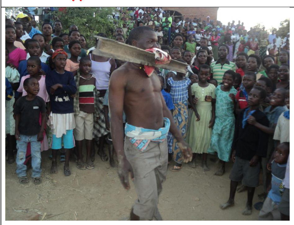
Performances by youth