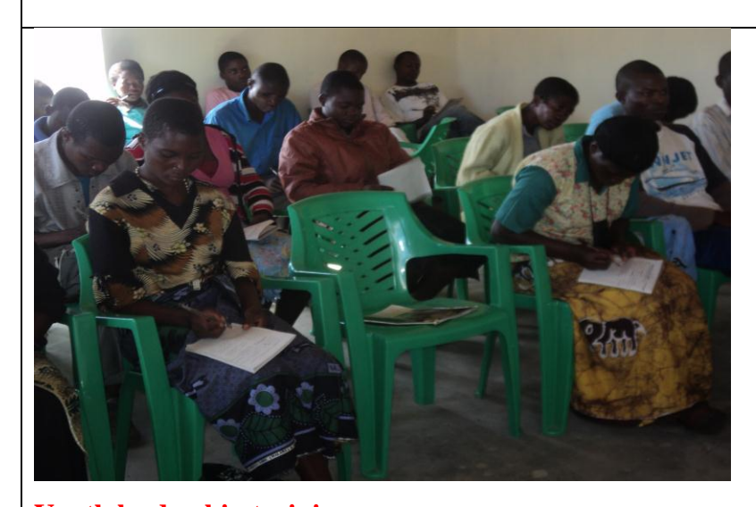
Youth leadership training