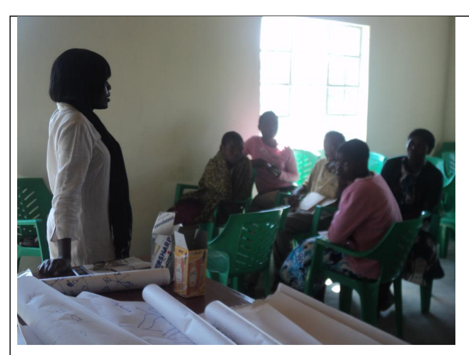
Youth leadership training