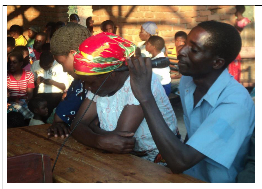
Adults in a debate