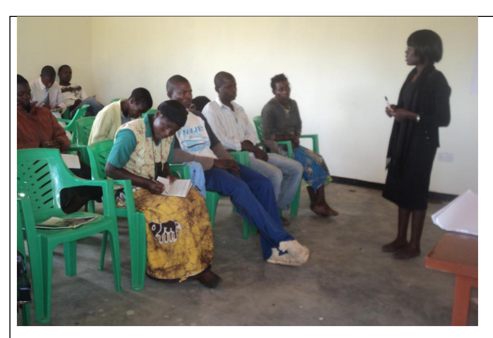
Youth leadership training