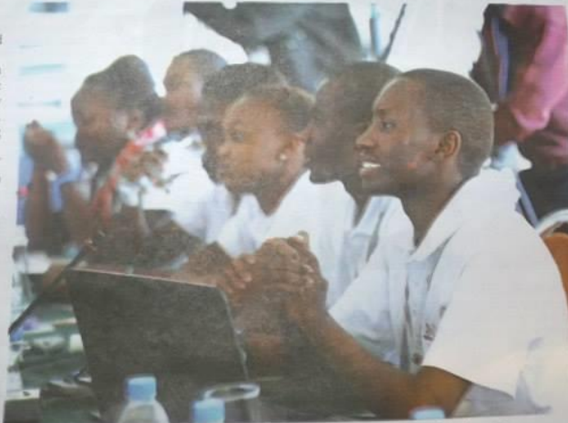
Youth listen to President Kagame during the Dialogue meeting yesterday, Village Urugwiro.

"You need to be stubborn. As they stay on course of caus-