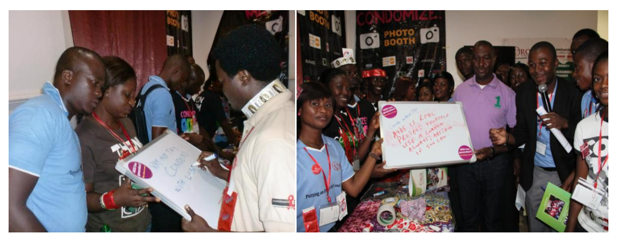
CONDOMIZE! DON'T COMPROMIZE