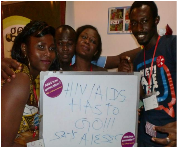
At gede foundation's stand