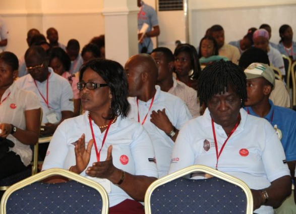
Cross-section of participants