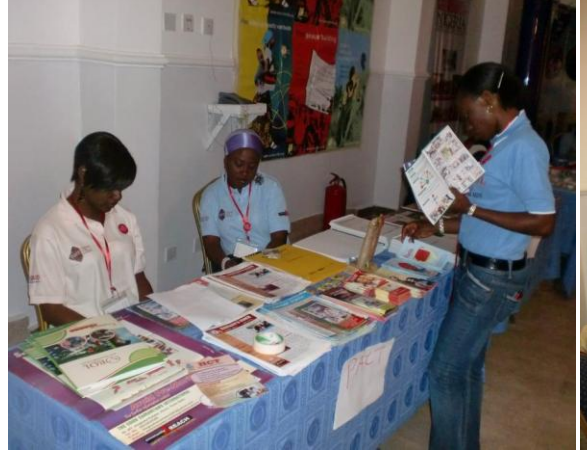
Pact Nigeria Exhibition Stand