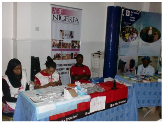
AIDS HEALTH CARE FOUNDATION STAND