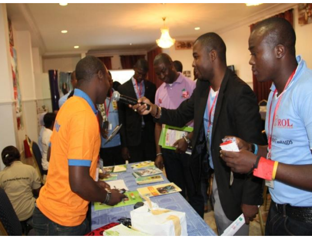
NMI Exhibition Stand