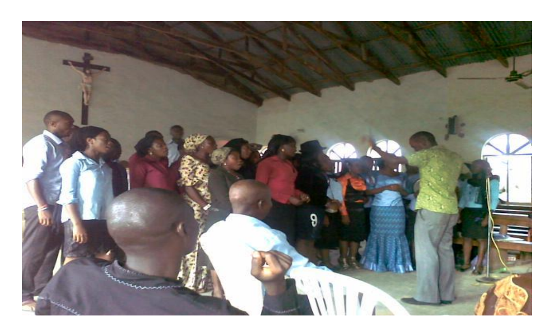
Singing songs of hope and better future ahead for the youths of Nigeria (Catholic Youth Organisation of Nigeria CYON)