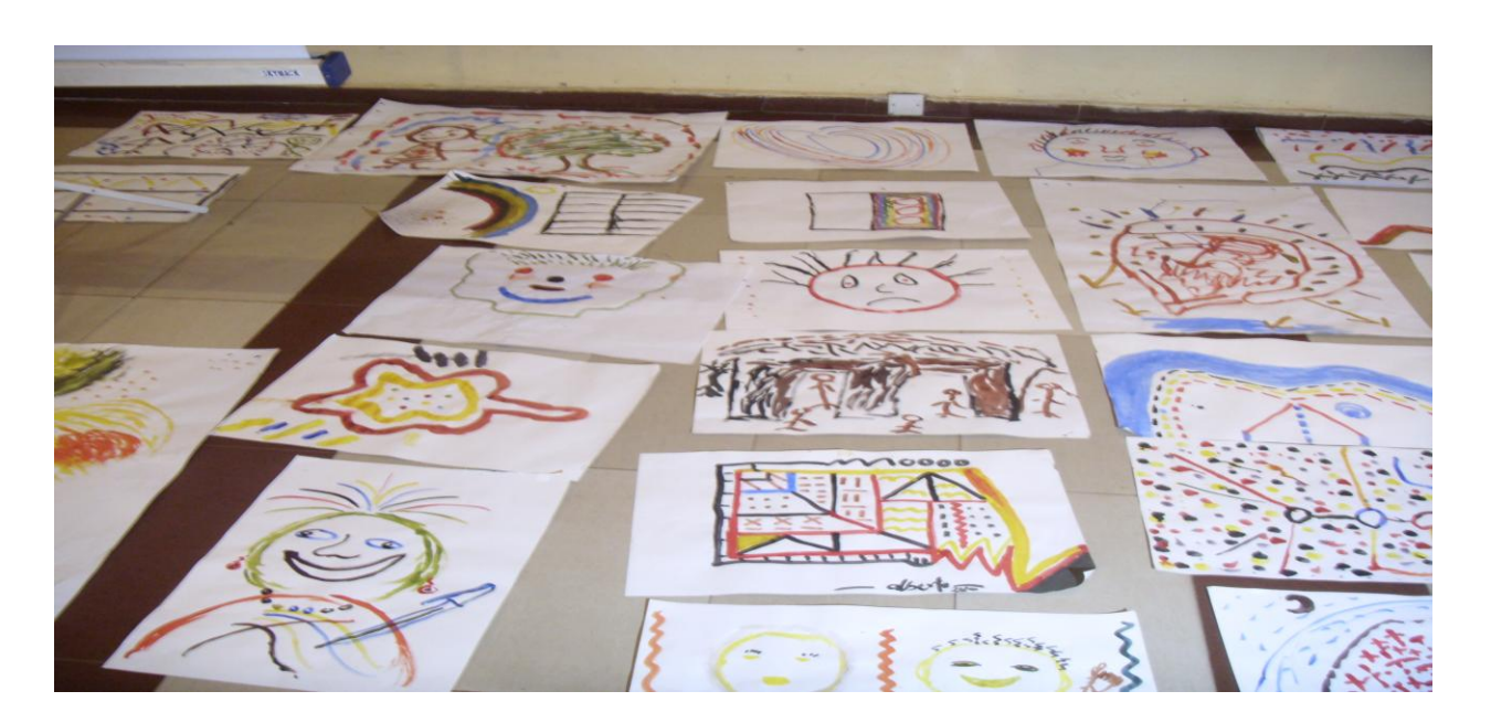
Different pictorial ideas of Good Governance drawn by the youth participant at the 2012 International Youth Day