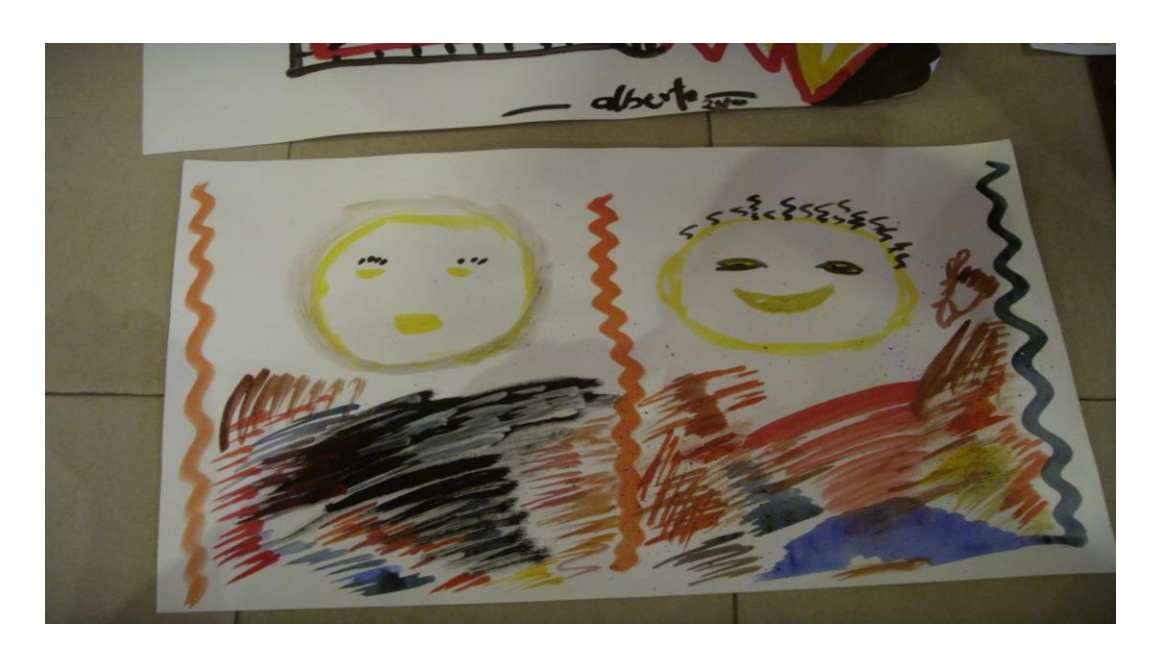
The ugly side of approach to governance and the renewed hope for good governance