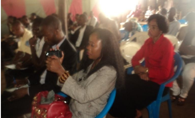
Participants to the Family Planning session at JSS Church